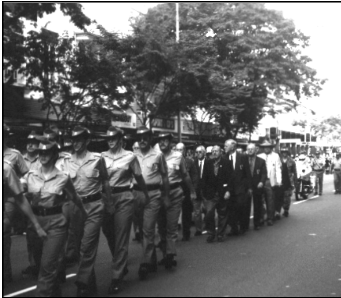
Reserve contingents - The present and the past.